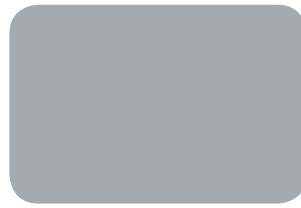
Ultra Silver Gloss (GY070A)