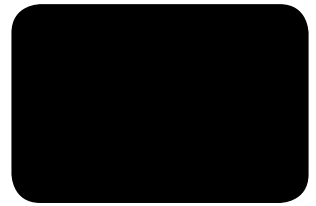
Custom Black Matt (GN248A)