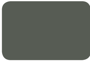
Woodland Grey® Matt (GL205A)