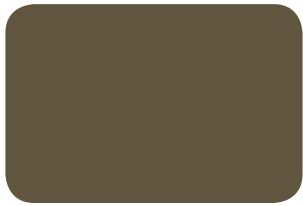
Jasper® Matt (GM214A)