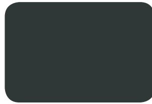
Monument® Matt (GL229A)