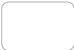
Pearl White Gloss (GA078A)